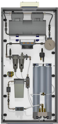
Oxygen Generation Panel

The ozone gas system consists of an oxygen generation panel and an ozone generation panel. The oxygen generation panel includes a compressor, heat exchanger, particle filter, air dryer, and oxygen concentrator. The ozone generation panel consists of an ozone generator, particle filters, ozone concentration analyzer with automatic zeroing, and a pressure and temperature compensated mass flow controller. Both panels are monitored with an extensive network of diagnostic sensors including temperature, pressure, humidity, and oxygen concentration. This information is used for predictive maintenance to ensure reliability.