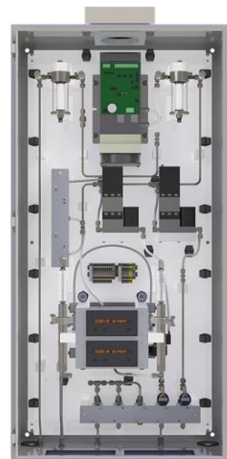
Ozone Generation Panel

The ozone gas system consists of an oxygen generation panel and an ozone generation panel. The oxygen generation panel includes a compressor, heat exchanger, particle filter, air dryer, and oxygen concentrator. The ozone generation panel consists of an ozone generator, particle filters, ozone concentration analyzer with automatic zeroing, and a pressure and temperature compensated mass flow controller. Both panels are monitored with an extensive network of diagnostic sensors including temperature, pressure, humidity, and oxygen concentration. This information is used for predictive maintenance to ensure reliability.